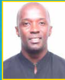
DICIENZO STORR Melia Nassau Beach Resort